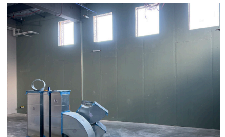
Above: Continuation of drywall at Area B.