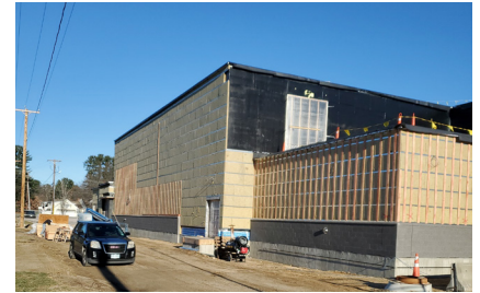
Above: Ongoing exterior insulation in preparation of Hardiepanel fiber cement siding.

PHASE 8: Commission elevator, occupy renovated 2nd floor of classroom wing, renovation of 1st floor classroom wing, complete all site improvements