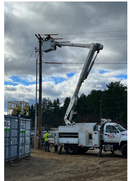
Above: New overhead electric service.